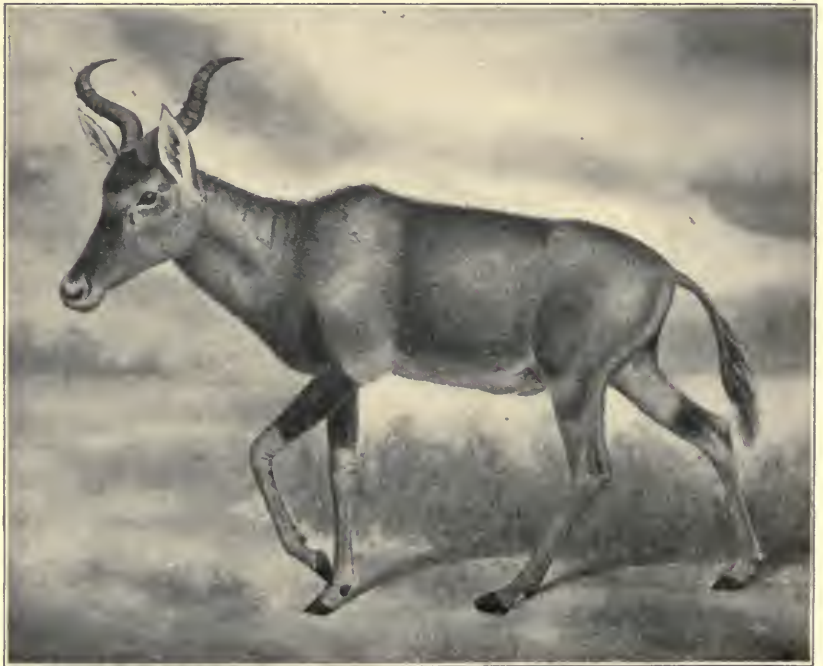
FIG. XI. BUBALIS SWAYNII. SWAYNE'S HARTEBEEEST.

Bubalis Frisch, Das Nat.-Syst. vierf. Thiere, in Tabellen, 2, Tab. Gen., 1775. Type Antilope buselaphus Pallas.